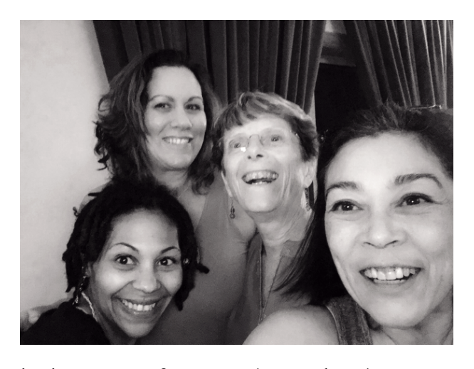
high energy after completing the class.

I have had my first Reiki 2 seminar here in South Carolina, and I am very excited about that! 3 amazing women that was willing to go deep within themselves. Joyful